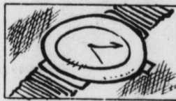
The jewels in a jewel watch are usually rubies or sapphires.