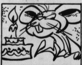
The expected lifespan for a mouse is about five years.

The couple cut a tiered wedding cake with pale yellow accents. A three-candle candelabra, daisies, yellow roses and baby's breath decorated the table.