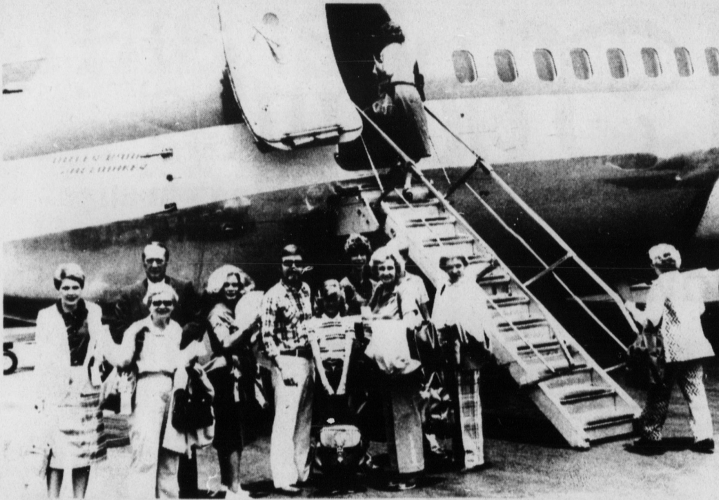
TOUR GROUP - Pictured above are some of recently in the "Great British Heritage" study tour.