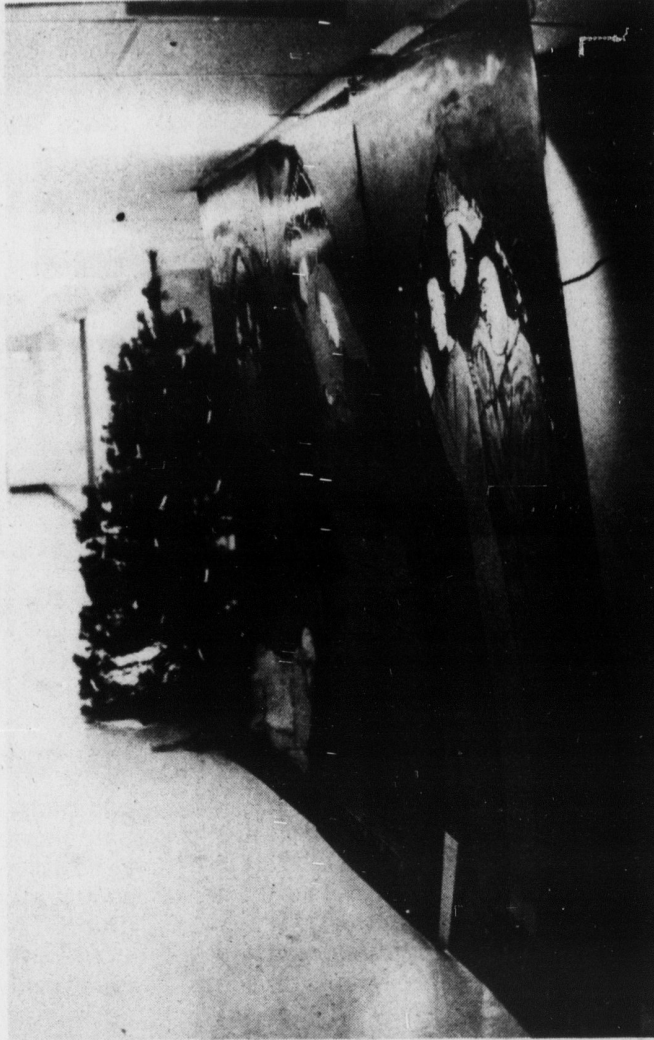
Lab's First Place Winner