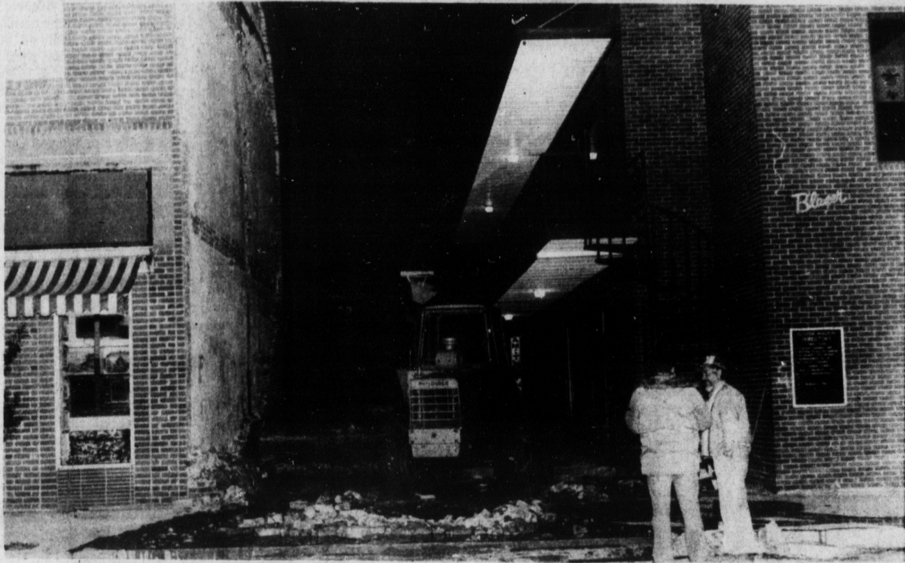
City crew cleans up destroyed wall....

The wall, which was built in 1973, had been bowing for