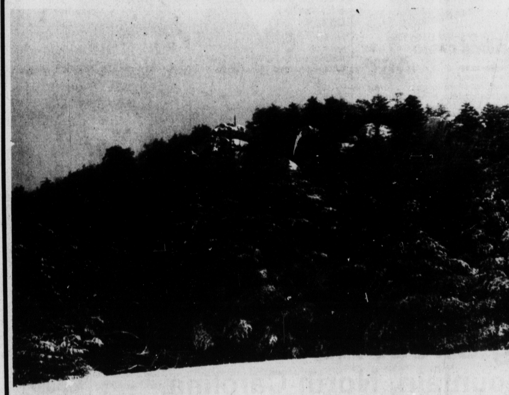
From Foot Of The Mountain...