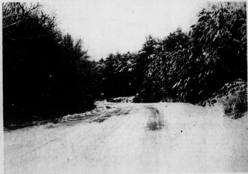
Love Valley Church Road...