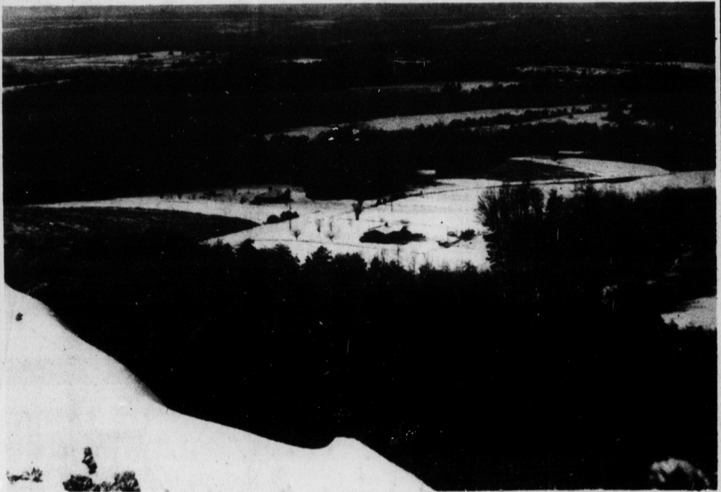
Looking Down On The Neighborhood...

What may appear to be no more than a large hill to eyes looking up turns into a picture of beauty for those same eyes when they look down on the neighborhood from atop the mountain.