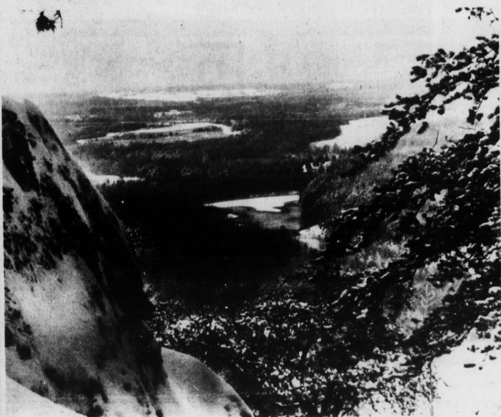
Looking Down On Snow-Covered Hughes Lake...