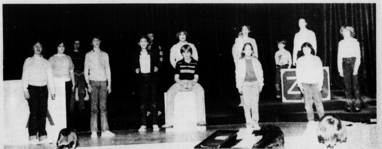
Cast Of 'You're A Good Man Charlie Brown'....