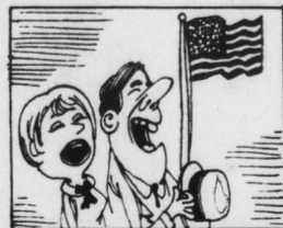
The "Star Spangled Banner," although written in 1814, did not become the national anthem until 1931.