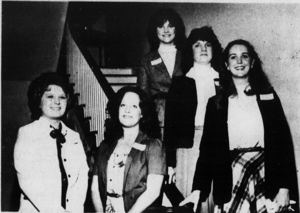
HONORED AT TEA - The five Kings Mountain debutantes pictured above were among 62 Cleveland County debs honored at an orientation tea sponsored by the Shelby Junior Charity League Wednesday at the