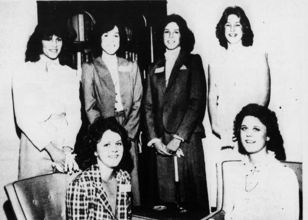
KM AREA DEBS - The six young ladies pictured above were among the 62 Cleveland County debutantes who were honored at an orientation tea Wednesday at the home of Dr.