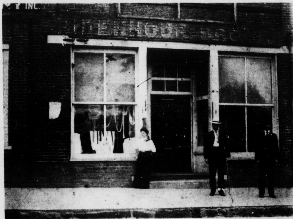
KISER-MAUNEY STORE - This is a photo of the Kiser-Mauney Store, located in the Williford Building in downtown Kings Mountain. The identity of the lady is not known.