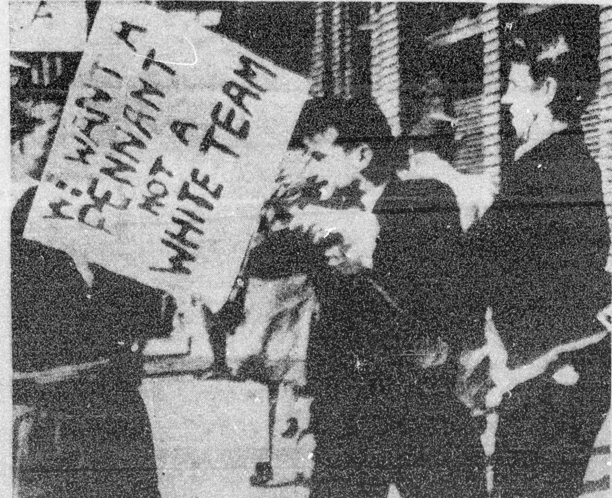
WHITES PROTEST JIM CROW BASEBALL — Youths are shown attacking a picket, center, carrying a placard reading, "We want a pennant, not a white team," outside Fenway Park, Boston, Mass., last Tuesday. The Boston Red Sox make their home in the New England city. The pickets were protesting the Red Sox sending Jerry (Pumpsie) Green back to the minors. Green would have been the first Negro to wear a Boston uniform.