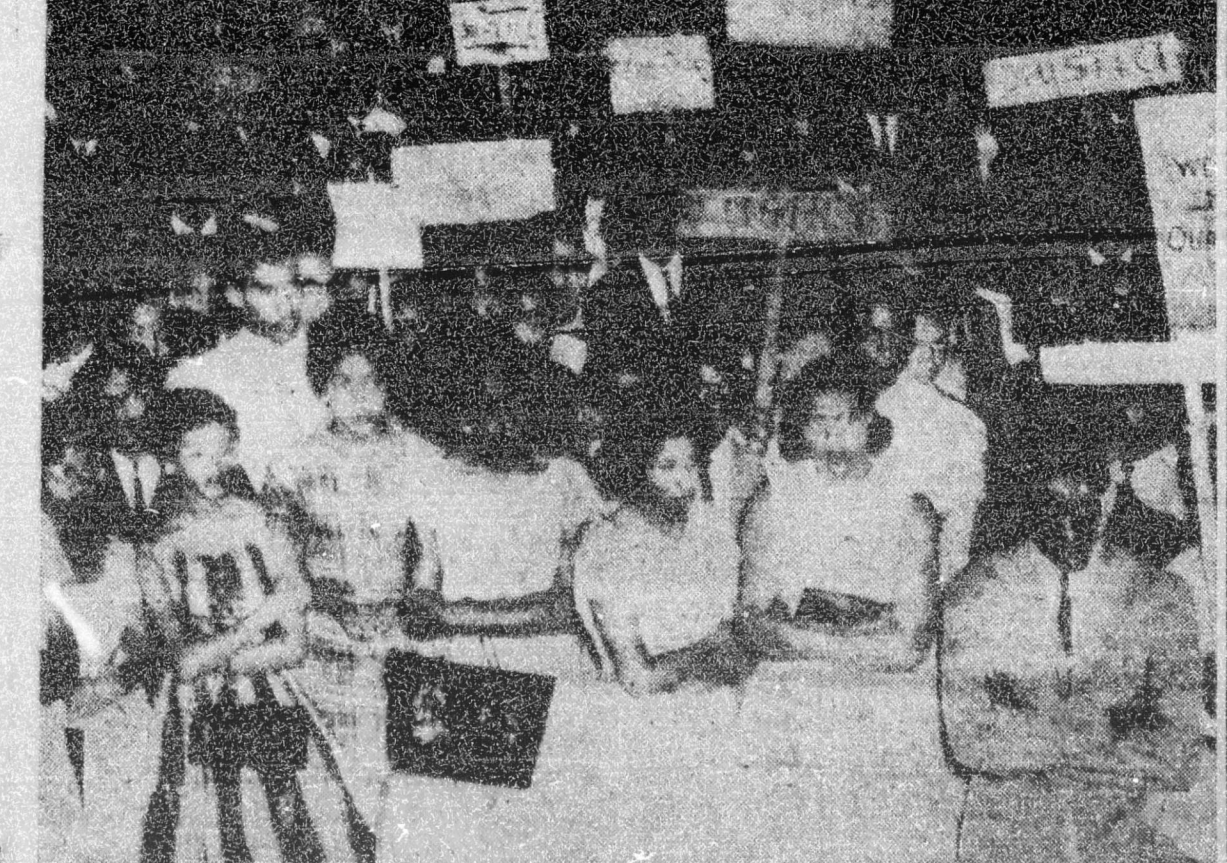
"PASSIVE RESISTANCE" PROTEST — Students of Florida A & M University, Tallahassee, crowd the school quadrangle at a "passive resistance" meeting to protest the rape of a 19-year-old coed by four white men. The students vowed to stage some kind of demonstration until the world knows about the incident.

Question: What does your mother do? Answer: Nothing. Question: Where does your mother go? Answer: Nowhere. Question: What time does your mother get up? Answer: About 6 o'clock. Question: What time does your mother go to bed? Answer: About 11 o'clock. Question: Who cooks, washes, irons, shops, is chairman of the "lost and found" bureau at your home? Answer: Mother.