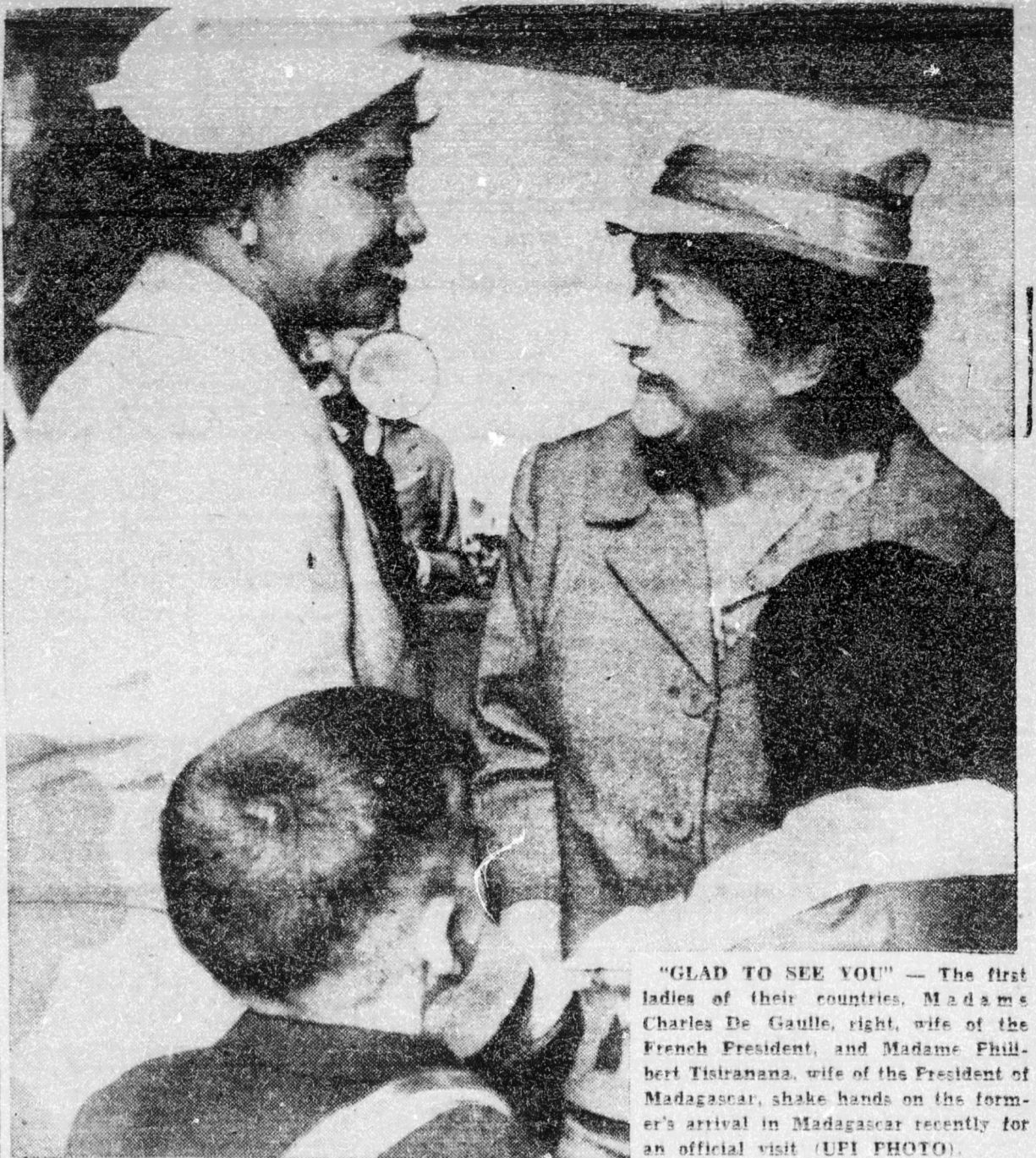
"GLAD TO SEE YOU" — The first ladies of their countries, Madame Charles De Gaulle, right, wife of the French President, and Madame Philibert Tsiranana, wife of the President of Madagascar, shake hands on the former's arrival in Madagascar recently for an official visit.