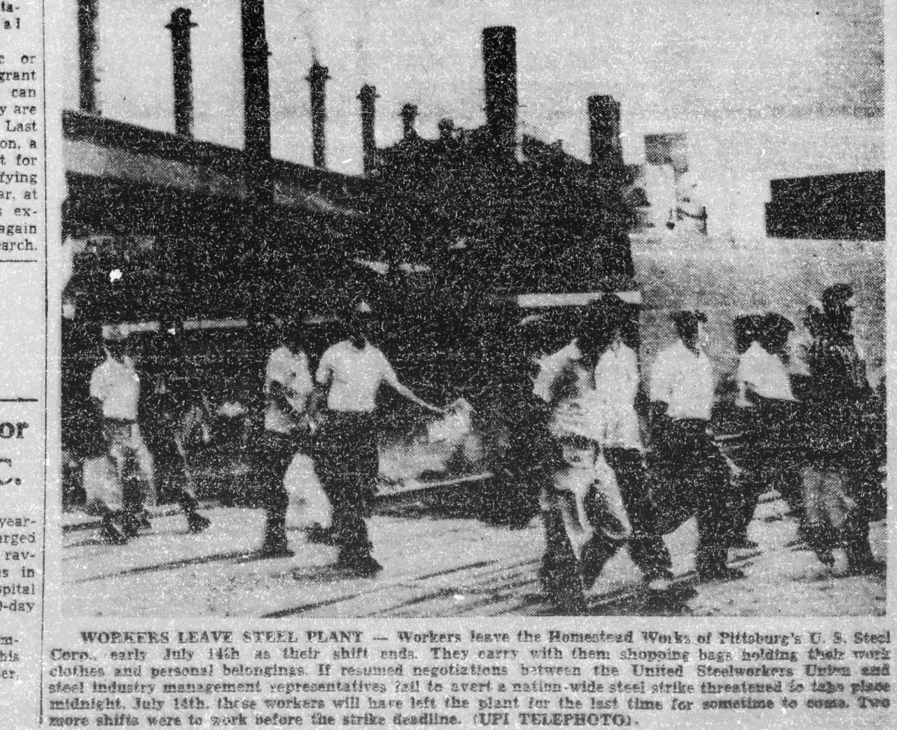
WORKERS LEAVE STEEL PLANT — Workers leave the Homestead Works of Pittsburgh's U. S. Steel Corp., early July 14th as their shift ends. They carry with them shopping bags holding their work clothes and personal belongings. If resumed negotiations between the United Steelworkers Union and steel industry management representatives fail to avert a nation-wide steel strike threatened to take place midnight, July 14th, these workers will have left the plant for the last time for sometime to come. Two more shifts were to work before the strike deadline.