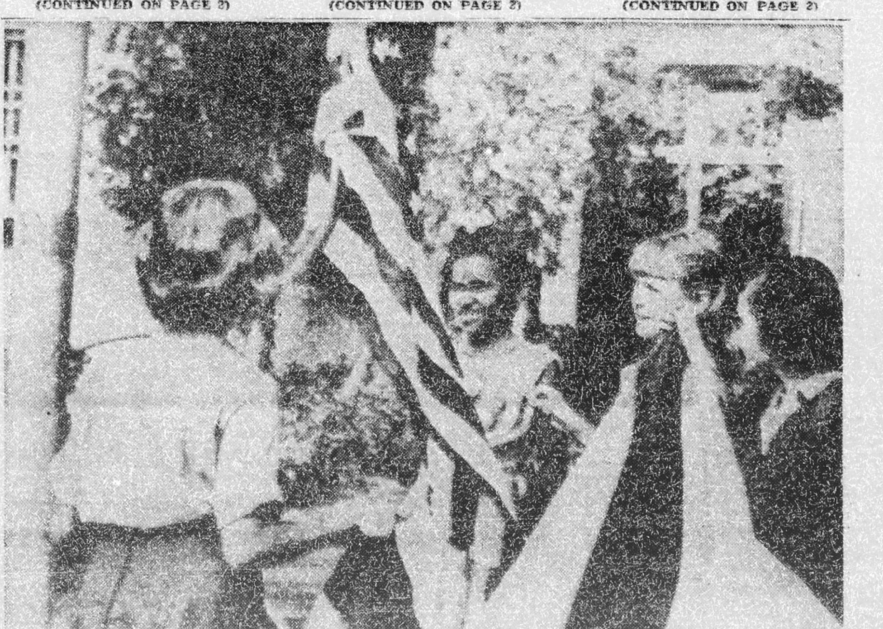
AT INTEGRATED SCHOOL. — A Negro youngster joins white students in a flag-raising ceremony at the newly-integrated Orchard Villa Elementary School, Miami, Fla., September 10th. The school became the first in Florida to integrate when four Negroes were admitted to classes, September 8th. (UPI TELEPHOTO).

NEW YORK —A boycott to protest the transfer of Negro and Puerto Rican children to five predominantly white schools apparently ended Tuesday. Reports from the schools and the Board of Education indicated that most of the more than 200 white students who stayed away from the opening day session Monday, were back in classes. Police assigned to special raids