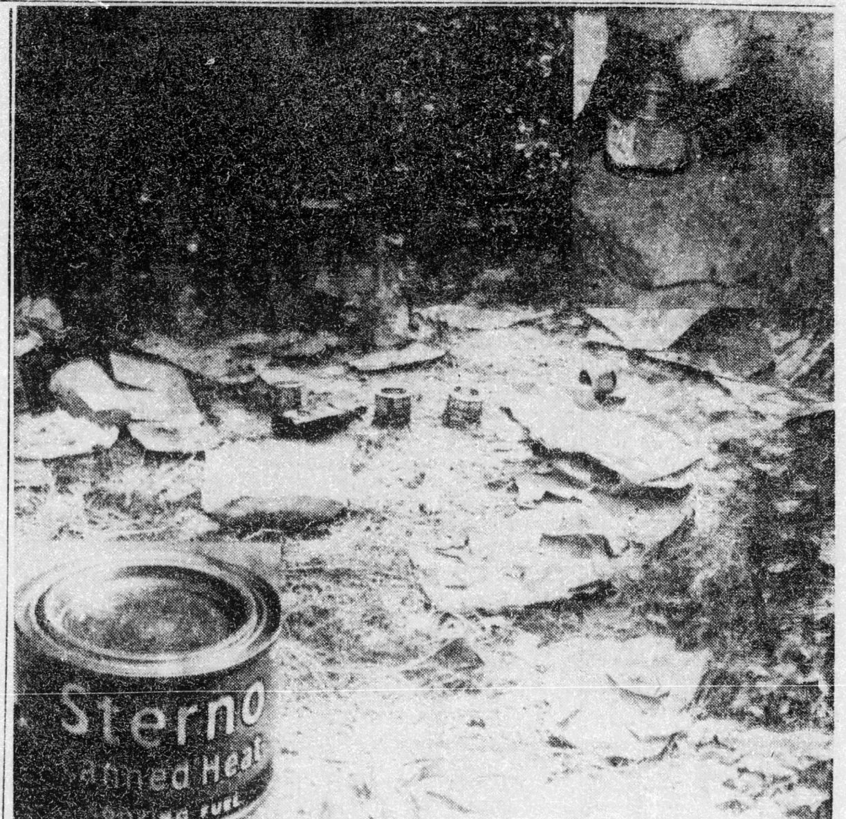
STERNO DRINKERS' HEADQUARTERS, "TOOLS"—The above scenes show where some of this city's drinkers of "Canned Heat" (Sterno) hang out, and the "tools" that they use in preparing the potent concoction. Photo above was taken this week off the 500 block of E. Martin Street. It shows where the men sleep after partaking of Sterno. Left inset is a closeup of the "heat" which is taken at the "melting pot," where Sterno is "fixed" for drinking. Police have begun a crack down on the men who pass through private property to get to the "headquarters."