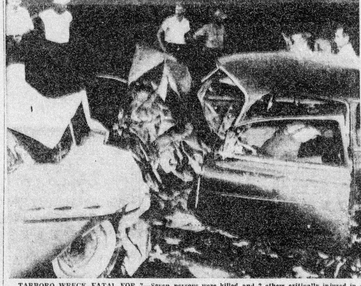
TARBORO WRECK FATAL FOR 7-Seven persons were killed and 2 others critically injured in head-on collision near Tarbore last Wednesday night. The auto at right, carrying eight persons, crossed the center line and hit the auto at left, carrying one occupant.