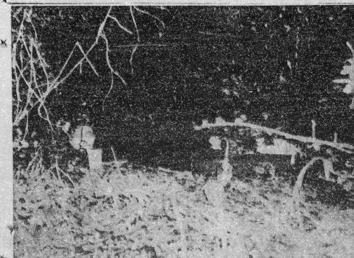
PEACEFUL SLEEP IN 'HOBO JUNGLE' — This photo was taken off the 500 block of E. Martin Street last weekend. Shown sleeping on the ground here is a man alleged to be a "Sterne addict," known to area residents as "Shorty." A cup is discernible in photo. Shortly after this picture was taken, "Shorty" was arrested and killed as a public drunk.