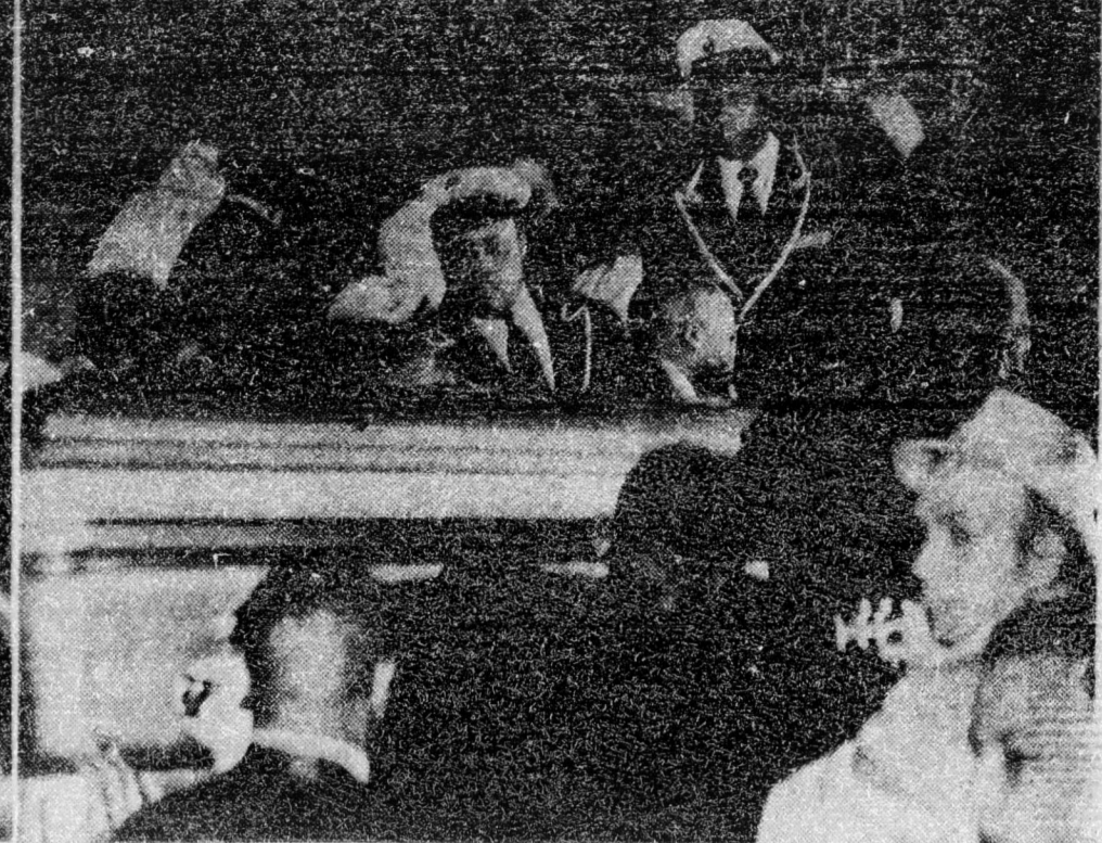
"SWEET DADDY" GRACE FUNERALIZED AT CHARLOTTE — Scenes from the funeral last Sunday of Bishop Charles Manuel "Sweet Daddy" Grace, are shown above. Bishop Grace, founder of the House of Prayer for All People, died Tuesday, January 12, at Los Angeles, California. Extreme left photo shows his body arriving at Charlotte last Sunday night