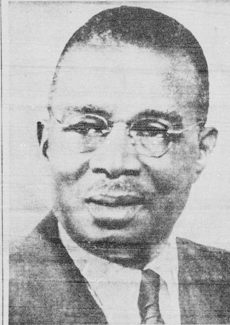
ATTORNEY'S HOME BOMBED — The home of Z. Alexander Looby (above) was bombed early April 19th, in Nashville, Tenn. Looby, a City Councilman and attorney has been active in anti-segregation suits for many years. No one was hurt in the pre-dawn explosion although two adjoining houses were damaged by the blast.