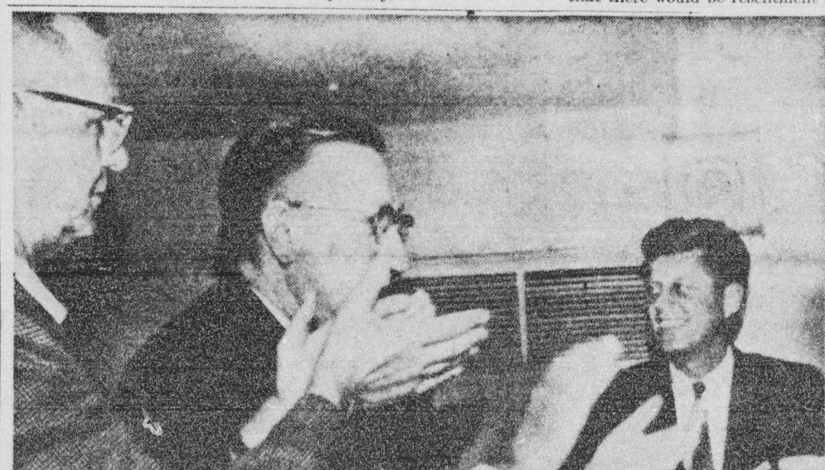
N. C. DELEGATES APPLAUD KENNEDY — Front-running Senator John Fitzgerald is applauded, above, after addressing the North Carolina delegation in Los Angeles, California's Statler-Hilton Hotel early last Tuesday. The senator told the split Tar Heel delegates that he realized a majority of them favored another candidate, but asked their support if he was nominated. Kennedy won the Democratic nomination.