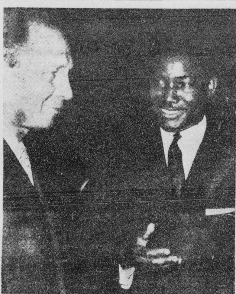
FAIR SHAKE FOLLOWED — Soviet Deputy Foreign Minister Vasily Kuznetsov, left, prepares to shake hands with Thomas Kanza, permanent Congo delegate to the U. N. last week at an emergency meeting. The Congo made a six-point demand that it be given a controlling voice in the operation of its affairs.