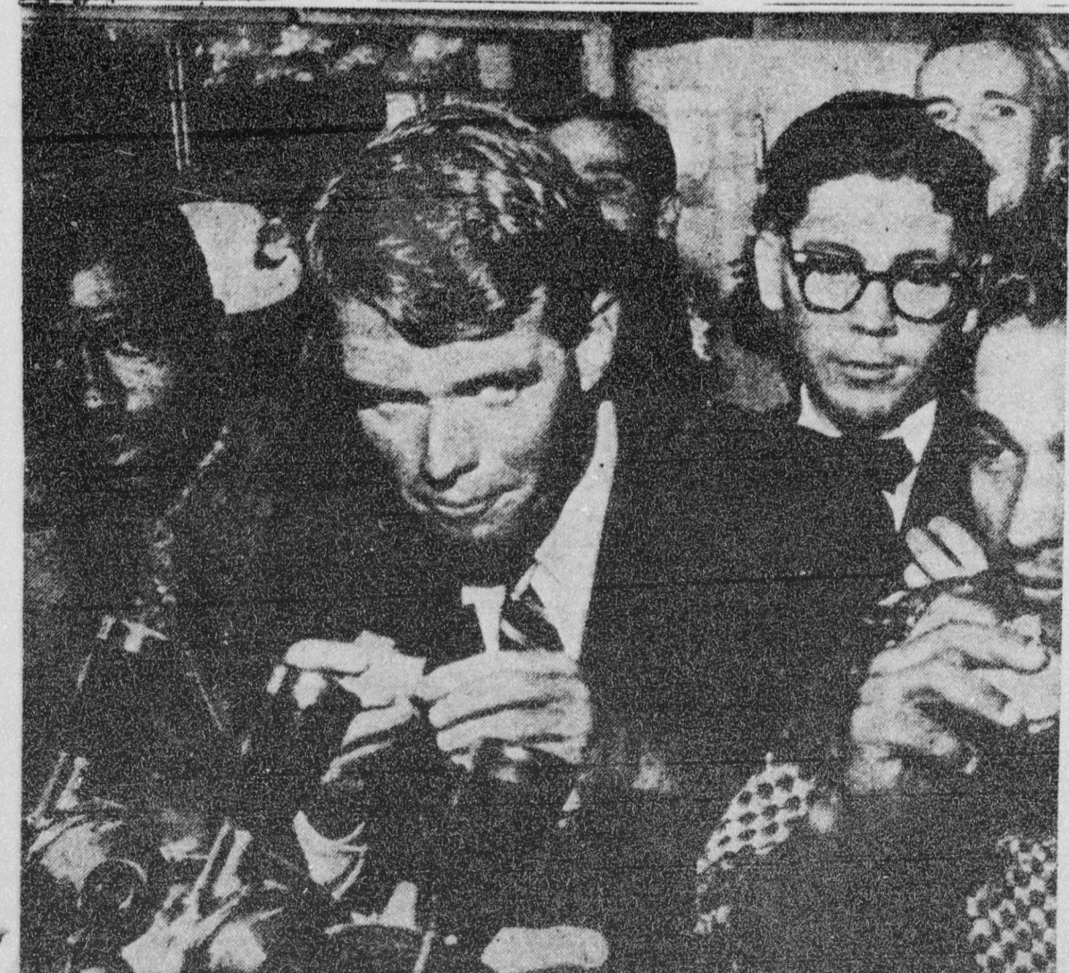
EATING ON CAMPAIGN TRAIL — Surrounded by Spanish Harlem crowd, Robert F. Kennedy (center) partakes of a snack in a restaurant August 24th. As campaign manager for his brother, democratic presidential nominee Senator John F. Kennedy, Robert Kennedy barnstormed the upper east side of Manhattan community, delivered speeches and shook hands all around.