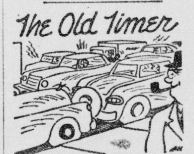
"One thing that keeps America on the move is the lack of parking space."