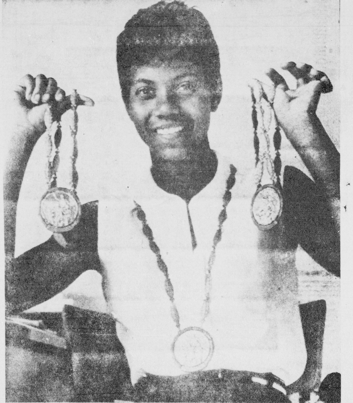
WILMA AND HER THREE GOLD MEDALS —Miss Wilma Rudolph, the United States' double dash champion from Clarksville, Tenn., proudly wears her third gold medal of the games won when she anchored the women's sprint team to a comfortable victory in that event.