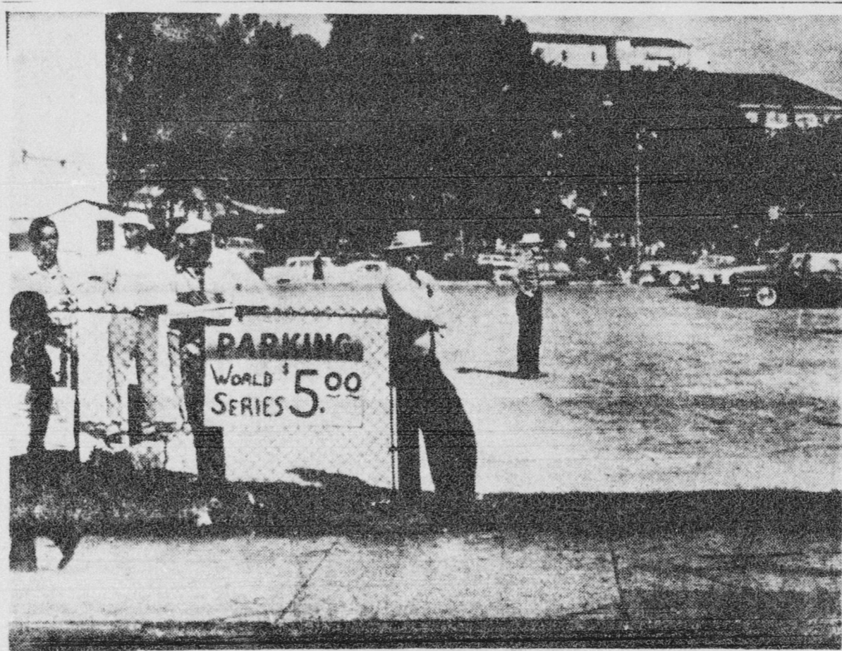
PARKING PRICES JUMP AT SERIES —Two hours before game time this parking lot found few customers for parking at Forbes Field, Pittsburgh, Pa., during the 1960 World Series between the Pirates and Yankees. The normal fee was one dollar a day earlier, but had gone to five dollars for the series. At CAROLINIAN press time the Pirates were leading the Yankees three games to two.