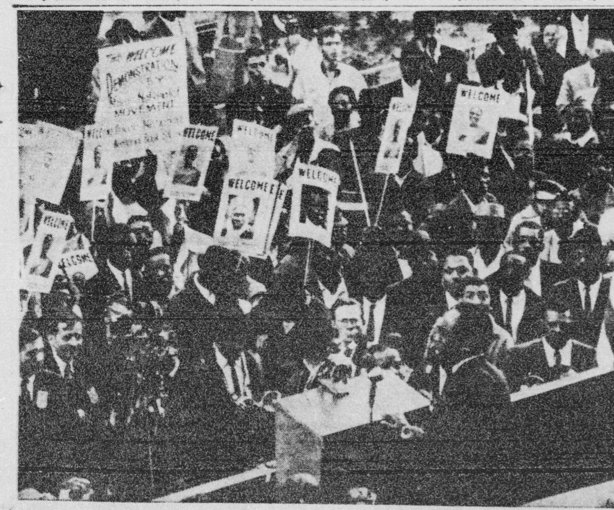
NKRUMAH SPEAKS IN HARLEM —Ghana President Kwame Nkrumah addresses crowd in front of the Hotel Theresa in Harlem. Nkrumah declared the 20,000,000 American Negroes constituted the strongest link between the people of North America and Africa. The rally was the last official activity attended by Nkrumah before he departed by plane for home. Police estimated the crowd at 1,000 persons.