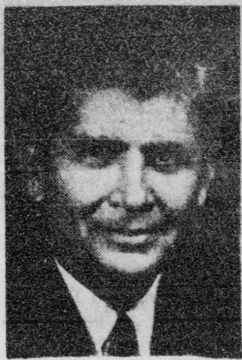
TERRY SANFORD ... Governor-elect