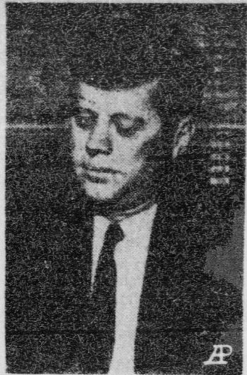
JOHN F. KENNEDY ... President-elect