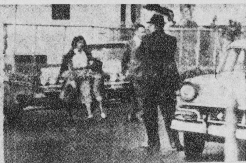
GOING AND COMING — New Orleans police and U. S. marshals are active in the going and coming of students to integrated William Frantz School. Patrolman and detectives of the