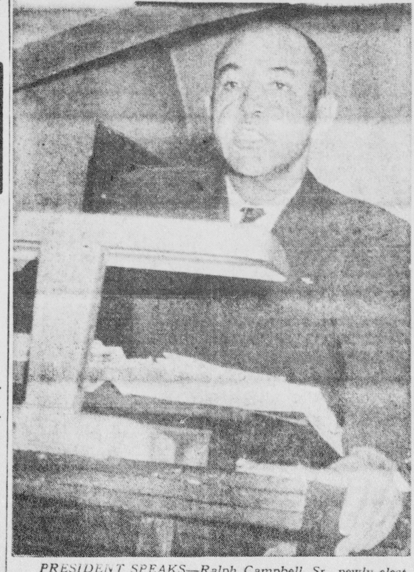
ed president of the local branch of the National Association for the Adavancement of Colored People, is shown above addressing an audince at the regular meeting of the body last Sunday, Maple Temple Christian was the host church for the session