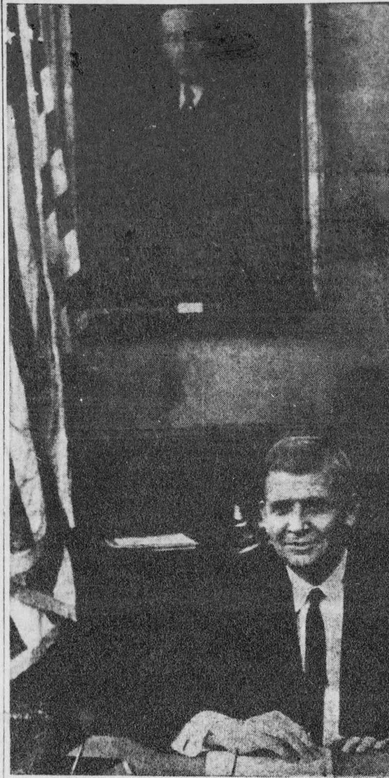
GOVERNOR TERRY SANFORD poses above for a formal picture at his desk here last Friday during his first day in office as North Carolina's new governor. He said his work on the first day in office was mainly to "stir around and look at the place."