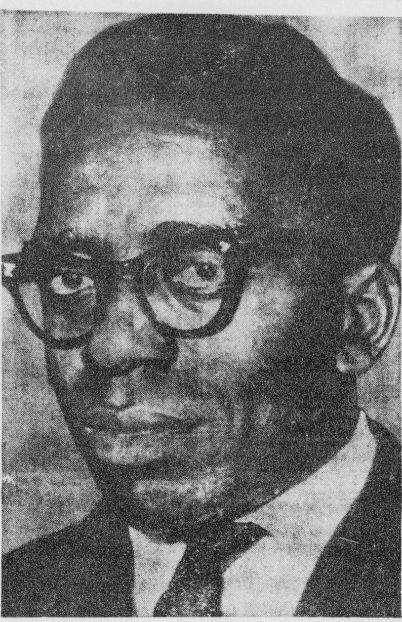
RUSSIA URGES RECOGNITION OF GIZENGA REGIME—In a formal statement, the Soviet Union called last week for recognition of the government of Antoine Gizenga, shown above, as the "legitimate government of the Congo." Gizenga was Vice Premier in the original government of the late Patrice Lumumba. At the same time, Russia said it would no longer recognize Dag Hammarskjold as Secretary-General of the United Nations and demanded his removal.