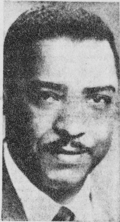
DR. SAMUEL D. PROCTOR

The Crown and Scepter Club is an Honor Society composed of outstanding students from ac-