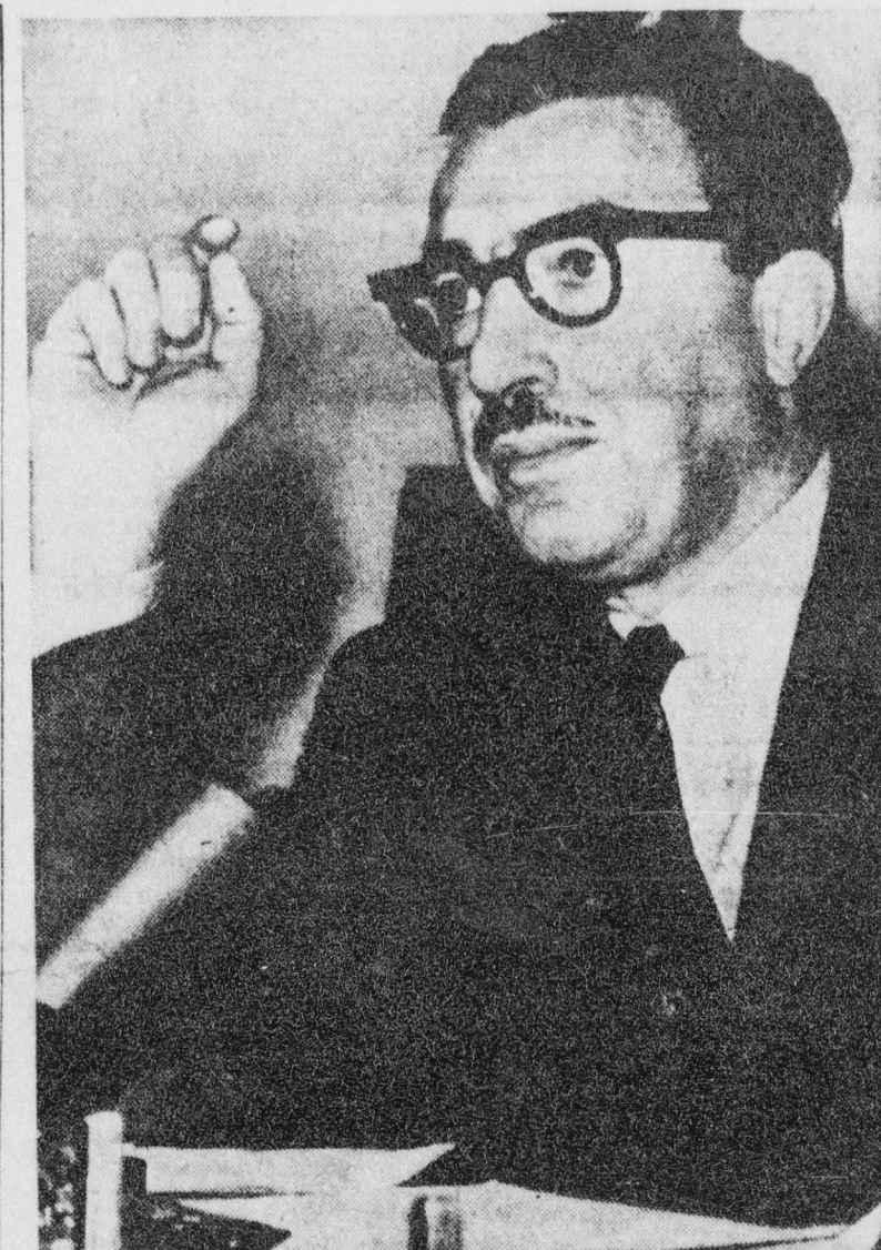
CHAIRMAN MAKES POINT—Rep. Adam Clayton Powell, Jr., (D-N.Y.), chairman of the House Education and Labor Committee, is shown above during a Washington news conference last week. He said he still hopes the present administration will act to bar proposed Federal school aid funds from localities defying the Supreme Court's anti-discrimination ruling. On another subject, he said preliminary checks show that a "first-class scandal" may be developing in union-company welfare and pension funds.