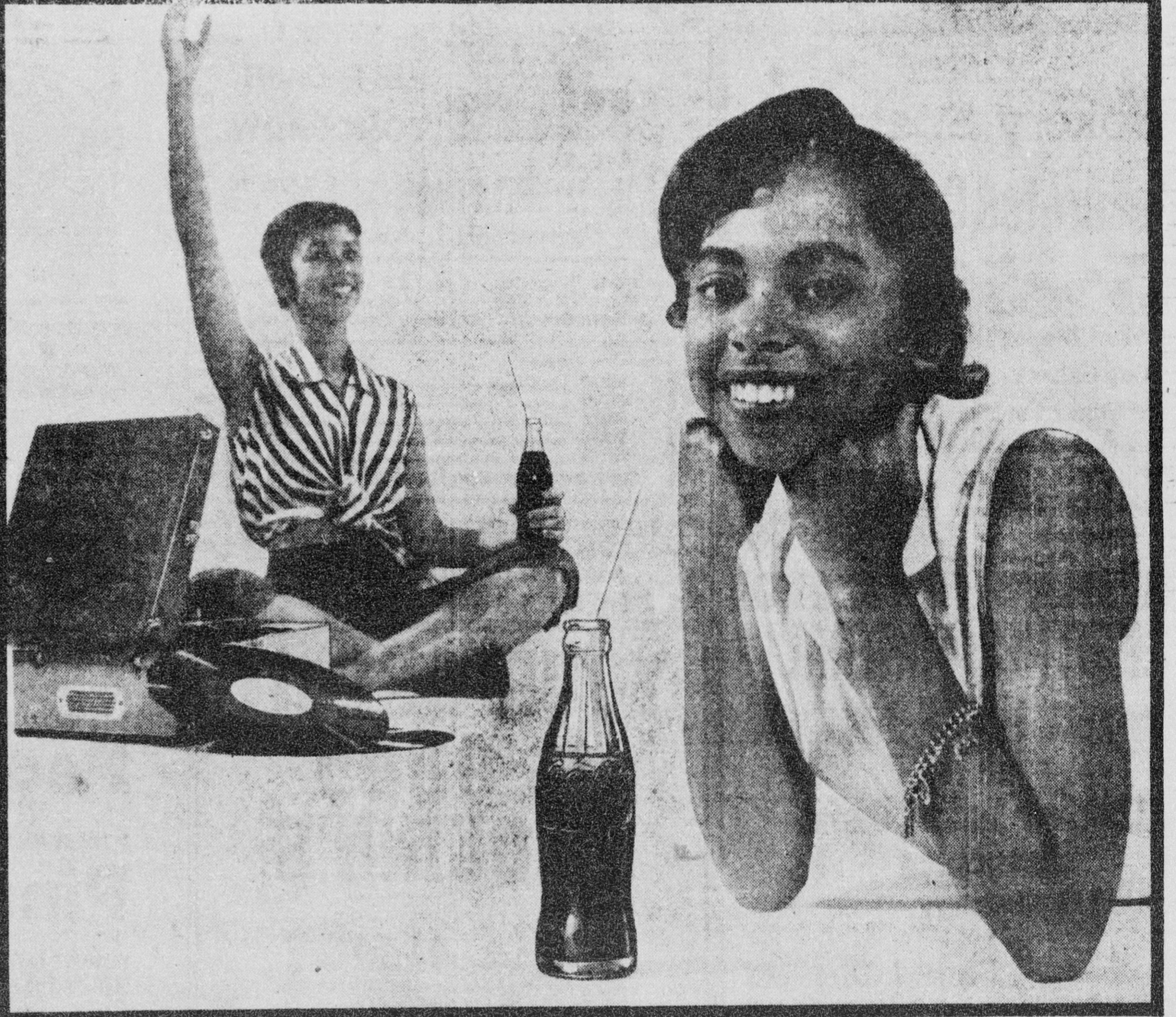
"Coke" is a registered trademark.

BE REALLY REFRESHED! ... PAUSE FOR COKE!