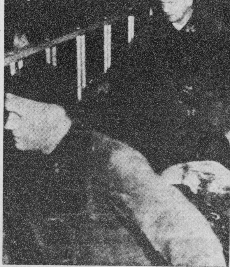
EXPLOSION VICTIM RESCUED — Firemen carry out an injured victim after an explosion blew out the front of a near north side night club in Chicago last week, killing one person and injuring at least 37 others. Fire officials said the blast was caused by a bomb.