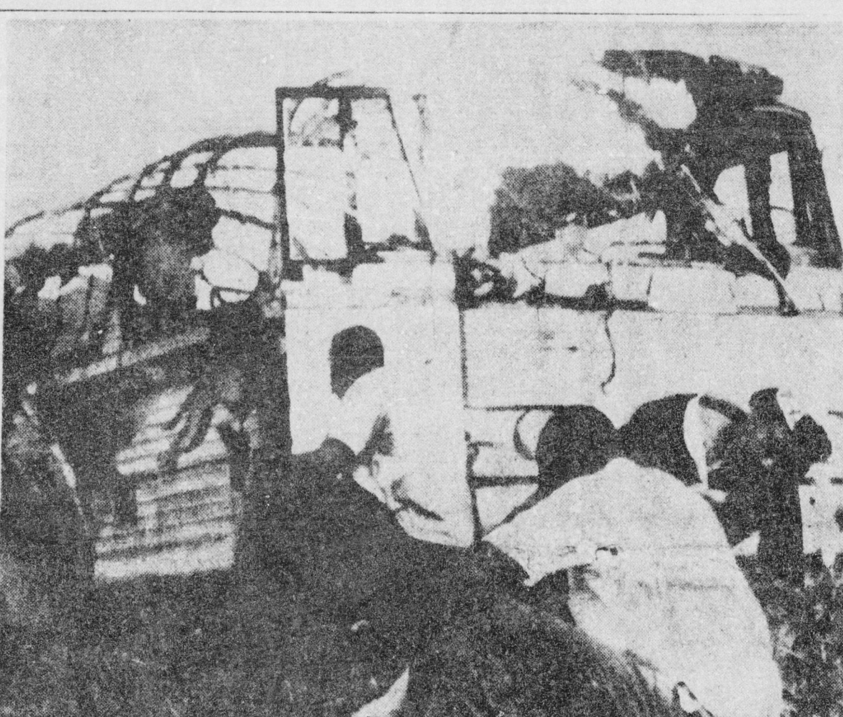
BURNED-OUT BUS — Passengers who were aboard a Greyhound bus sit disconsolately outside the gutted hulk of the vehicle after it was burned by a howling mob of whites outside Anniston, Ala., last week. A mob met the bus carrying a bi-racial integrationist group, stoned it and slashed the tires and then followed the bus out of town and tossed gas bombs in it when it stopped for repairs.