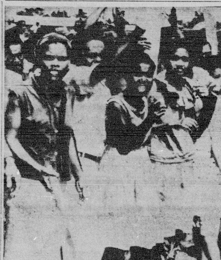
MOB VIOLENCE — An angry mob, armed with rocks and sticks is restrained by police after attempting to storm a church in the Dominican Republic last week. The rioters were after members of the "M.P.D.," a leftist group branded unfavorably by the Dominican government.