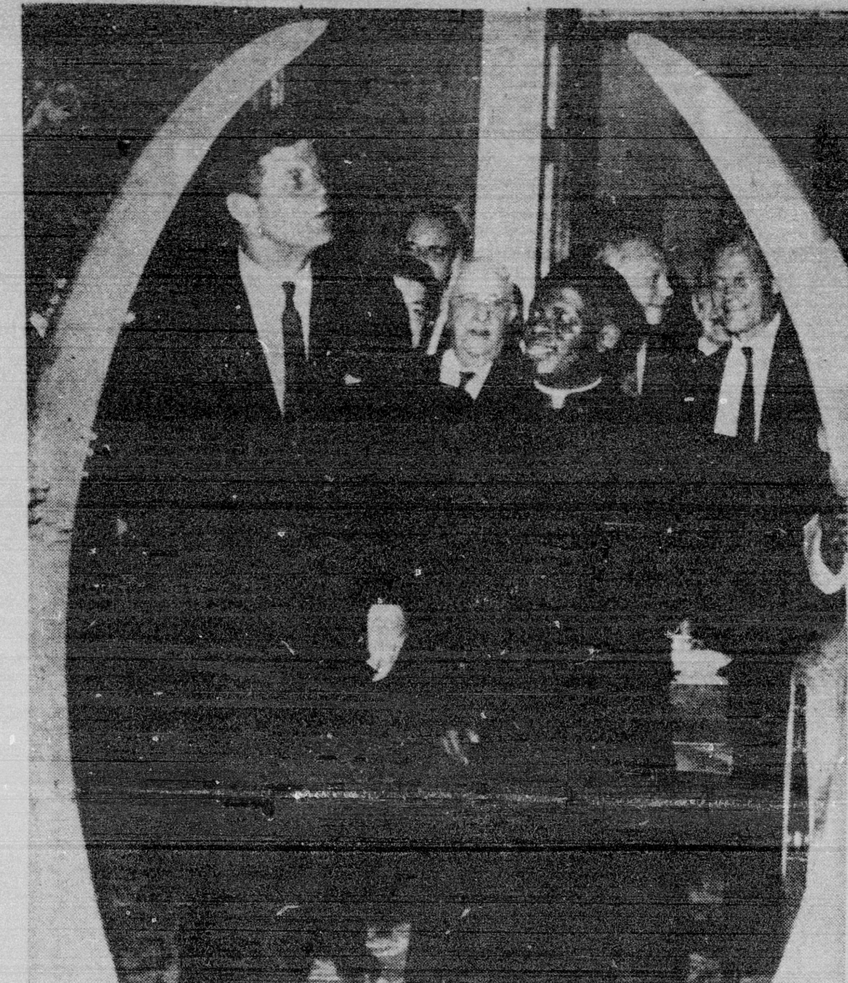
PRESIDENT KENNEDY GETS ELEPHANT TUSKS—Congo Republic President Fulbert Youlou, who was in Washington on a two-day informal visit last week, presents two full-length elephant tusks to President John F. Kennedy at the White House. In turn, President Kennedy presented his guest with a sculptured head of Abraham Lincoln.