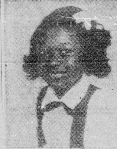
MISS WASHINGTON — accepted at Murphey