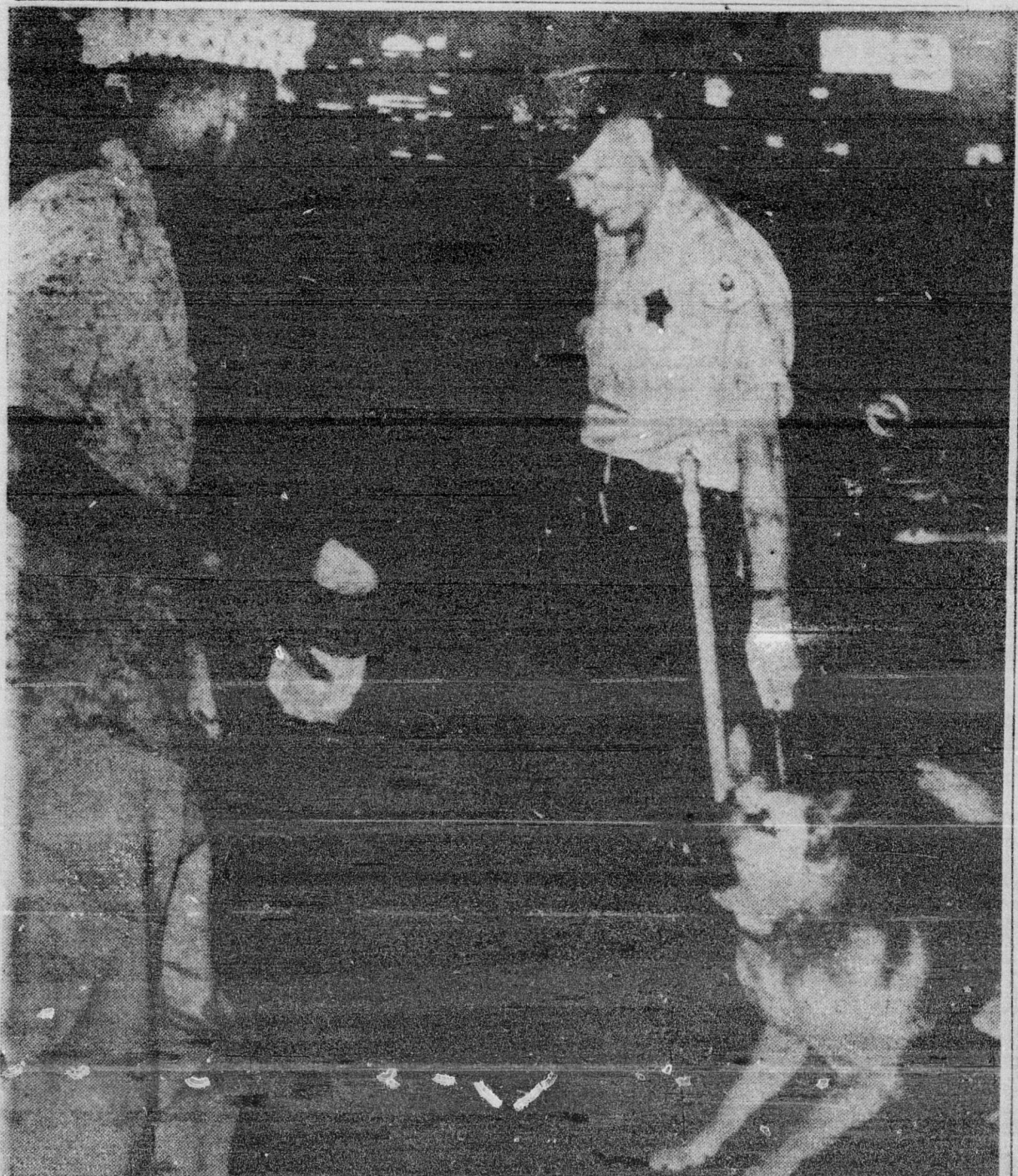
DOGS ADDED TO POLICE FORCE — A man carrying a bottle backs away, July 18, as "Alvin" one of Chicago's new police dogs snarls at him. The incident occurred as a special police detail began patrolling one of the city's Negro areas following recent outbreaks of racial disturbances. The dogs are part of the "Canine Corps" put into service for night duty to assist police in case of outbreaks.