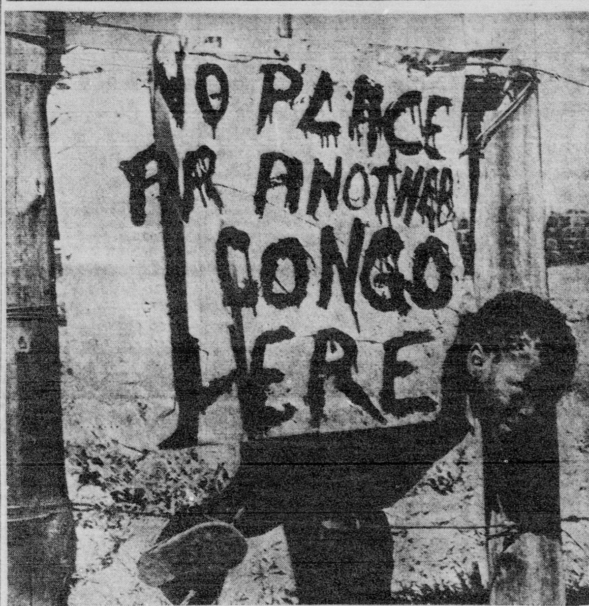
GREETING THE VISITOR — A little child crawls out from beneath a banner that was hung up for the arrival of U. S. Undersecretary of State for African Affairs G. Mennen Williams. Williams is currently in Africa on his second trip as President Kennedy's ambassador to these newly-developed nations.