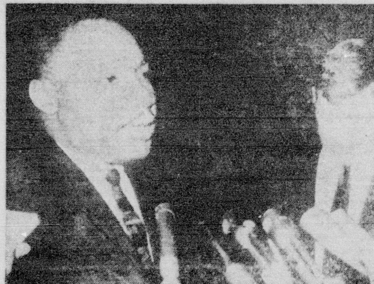
Dr. Martin Luther King talks with reporters after his conference with President Kennedy at White House during which he asked him to issue a "Second Emancipation Proclamation."