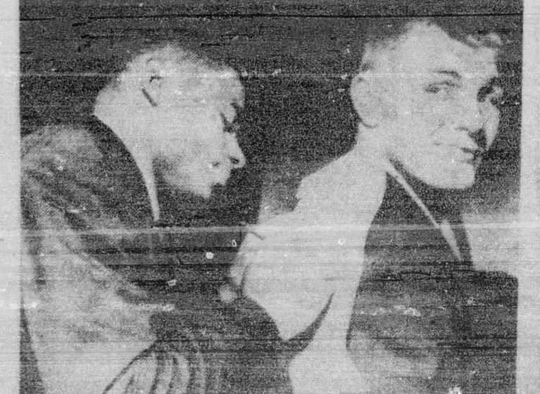
World Heavyweight Champion Floyd Patterson used back of challenger Tom McNeely as two signed contract to meet in title bout, December 4, in Toronto.