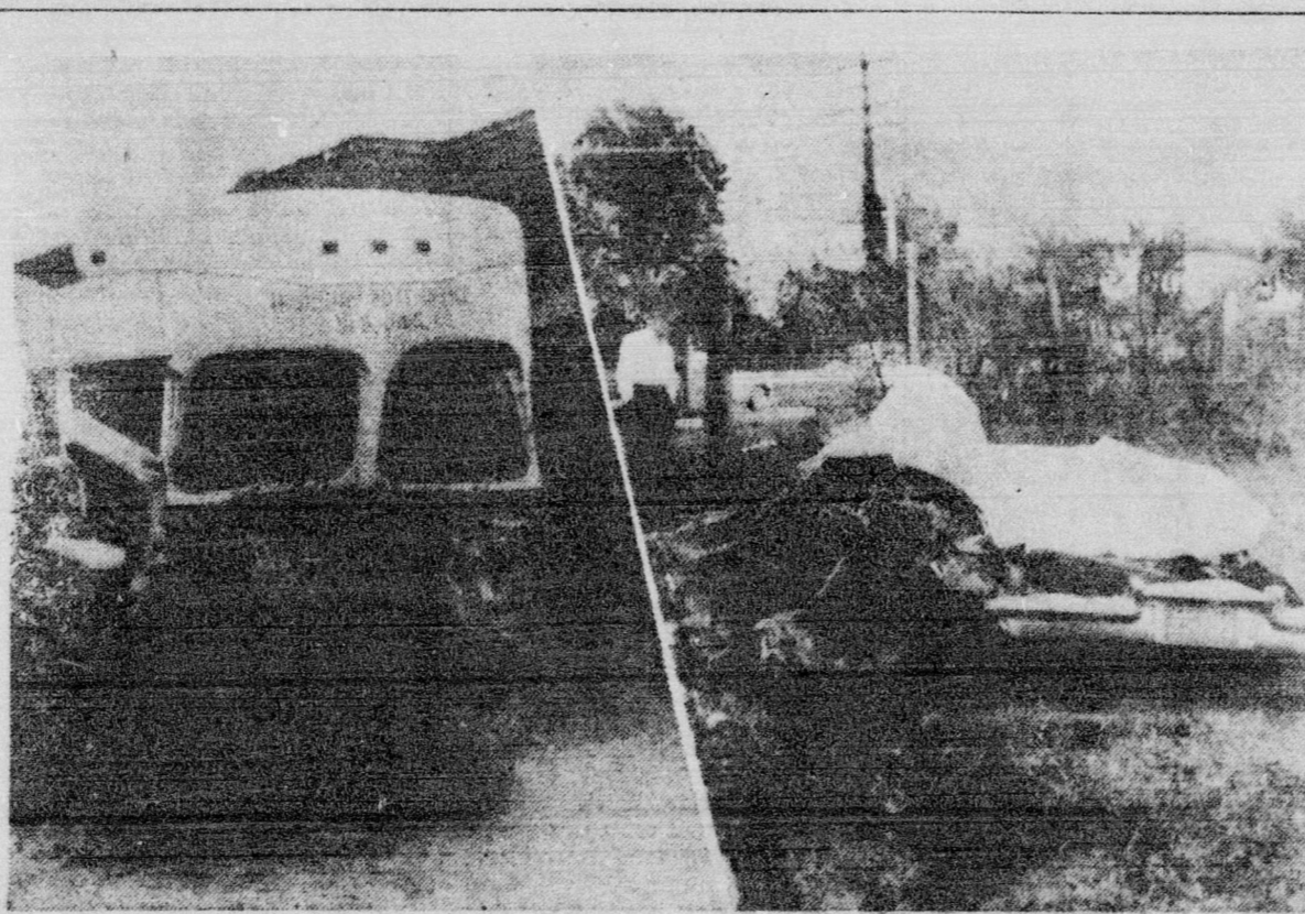
DEATH VEHICLES — These are the two vehicles that caused the death of five persons, Saturday afternoon, in one of the worst wrecks that Wake County has had in a long time. The auto was so badly torn up until it was hard to tell what year it was made. The mail truck was also badly damaged.