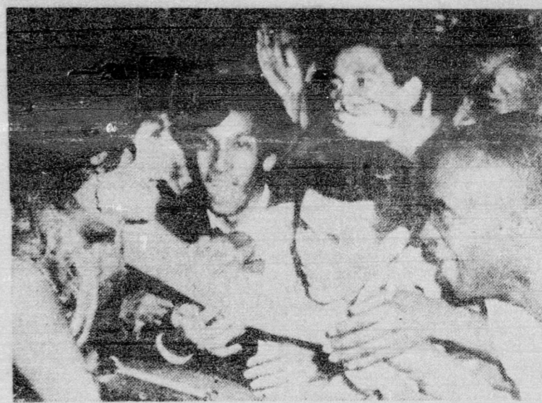
Rita Moreno, star of the movie, "West Side Story," greets fans on arrival at New York's Rivoli Theatre for world premiere.