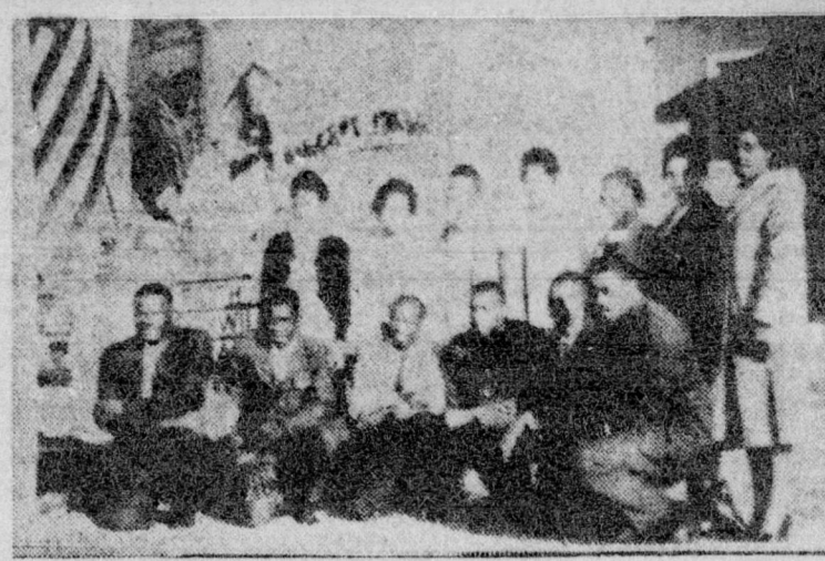
These students at A&T College, Greensboro were principals in the annual observance of United Nations Day held last week. They hail from North Carolina, Georgia, Florida and Virginia.