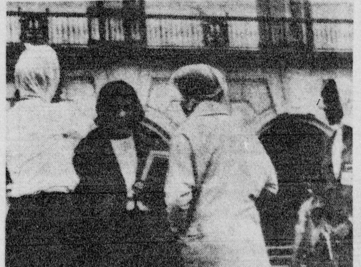
Four Negro women students at the University of Texas talk in front of the university's administration building after a rally trying to urge the administration to call on the state board of regents to integrate campus dormitories.