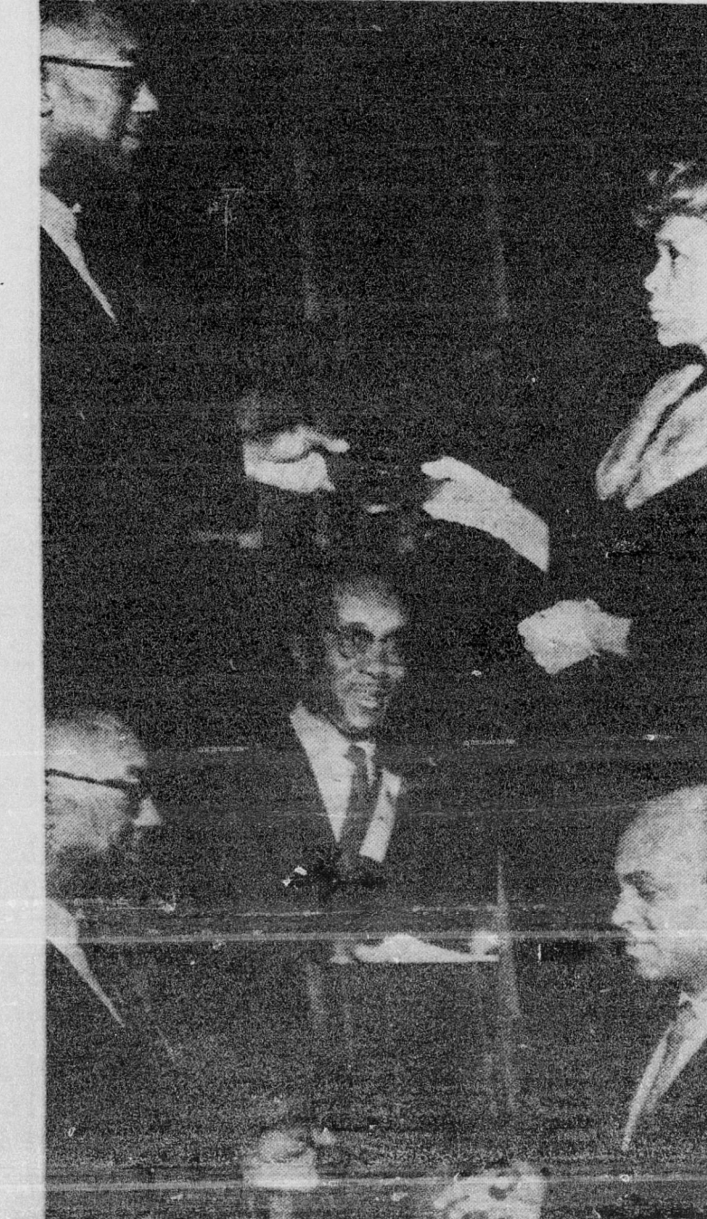
OMEGAS HONOR TWO LOCAL CITIZENS — "National Achievement Week" was observed by the Omega Psi Phi Fraternity last week and on Sunday, Nov. 12, two local residents were honored...