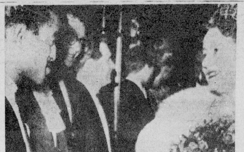
Sammy Davis, Jr., left, talks with Britain's Queen Mother Elizabeth last week at a theatre in London. Members of the royal family met a number of stars backstage.