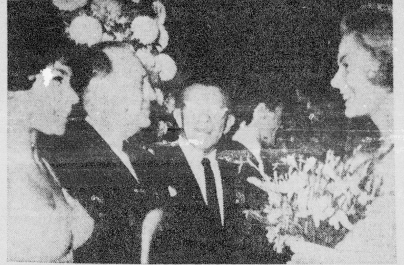
Following a performance at a London theatre last week, members of the British royal family visited backstage. Left to right are: entertainers Shirley Bassey, Jack Benny, George Burns, chatting with the Duchess of Kent.