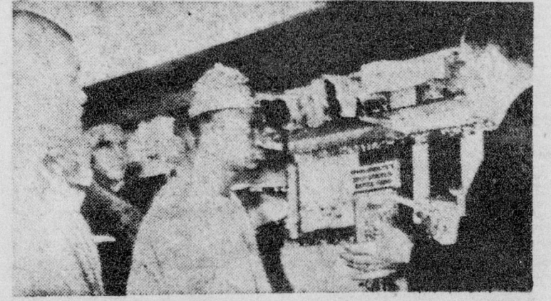
Woolworth's Store was one of the prime spots of interest for Hon. O. Adeniji, left of Nigeria and other diplomatic representatives from African countries as they observed "Africa Week In San Francisco" last week.