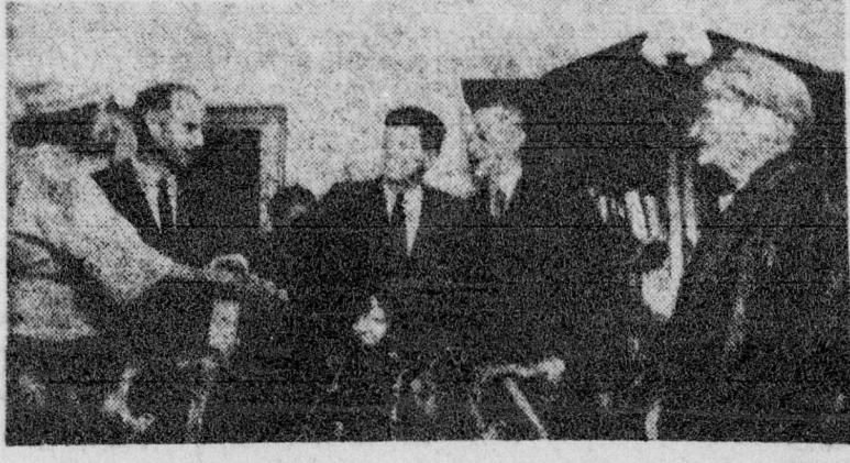
Singer Marion Anderson is shown on the left greeting President John F. Kennedy and Chancellor Konrad Adenauer of Germany at the White House last week. She was attending a meeting of the Freedom from Hunger Campaign in Washington at the time.