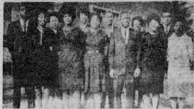
An even dozen students at Fayetteville State Teachers College have been added to the 1961-62 edition of "Who's Who Among Students in American College and Universities." All are North Carolinians except one.