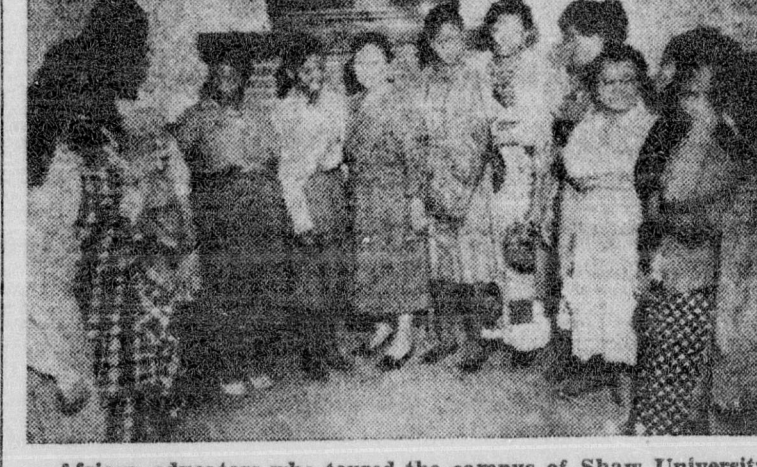
African educators who toured the campus of Shaw University recently. They talked with members of the student body and the faculty. They are said to have had an interesting visit at the Baptist institution.