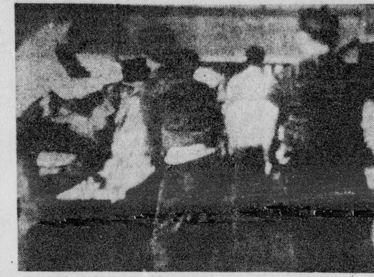
A scene at McComb, Miss., where five freedom riders were badly beaten and dragged from a bus terminal, when they tried to make democracy work as proclaimed by the constitution.