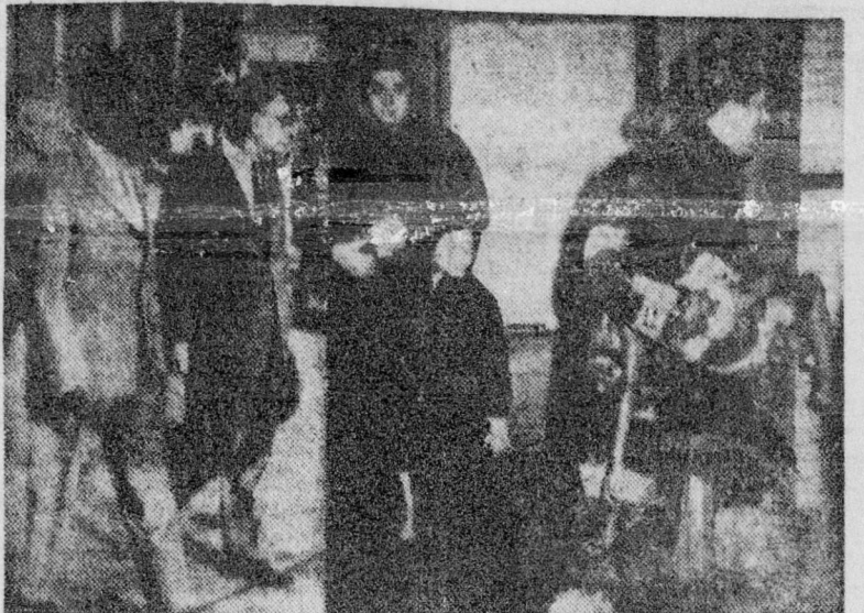
U. N. Assistant Secretary General, Ralph Bunche (right), reviews honor guards of the Congolese troops on his arrival on a fact-finding mission in Leopoldville. Shown with him are (left to right): Congolese Army Chief Gen. Joseph Mobutu; U. A. Military Commander Gen. Sean McKeown; and Congolese Premier Cyrille Adoula.