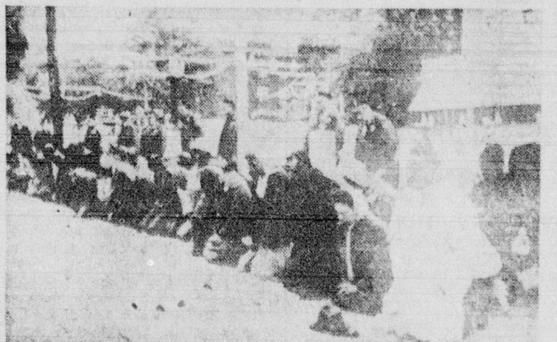
Over 60 Negro demonstrators sing and pray in front of the City Hall in Albany, Ga., for a just verdict in the hearing of 11 "Freedom Riders." A score of policemen formed a protective cordon to forestall any possible violence. Several were arrested after refusing to disperse when ordered.