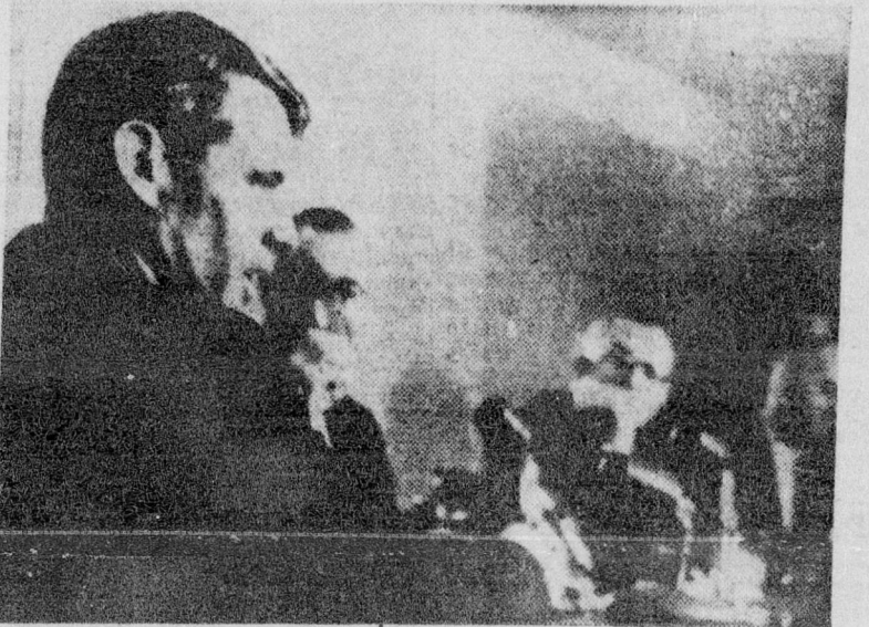
U. S. Attorney General Robert F. Kennedy holds a brief press conference on his arrival in Columbia, S. C. Kennedy was there to meet with the U. S. District Attorneys from North and South Carolina.