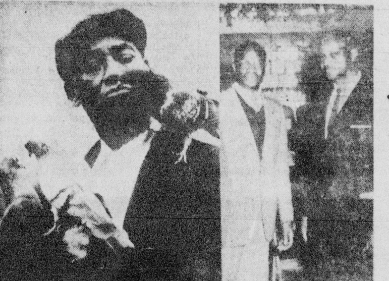
The two birds praise the generosity of this man as they perch on his arm. A third bird enjoys a quick lunch from the lips of the man. That goes to show that a bird won't mind working for his food.