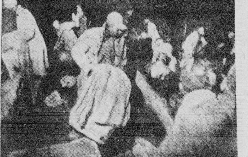
JACKSON, Miss., Dec. 14th: Prisoners from the Mississippi State Penitentiary, are shown packing sand bags in an attempt to save Flooded, a small industrial community, where more than 800 families have been left homeless, from the rising waters of the Pearl River.