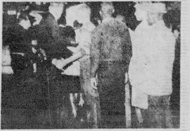
NEW ORLEANS, La.: An estimated 300 Negroes, who tried to march on the State Office Building, in downtown New Orleans, Dec. 18, are shown as police paddy wagons are loading them to be booked. The marchers according to CORE were to protest the "unjust arrest" of the 73 Negroes on Dec. 15, at Baton Rouge.