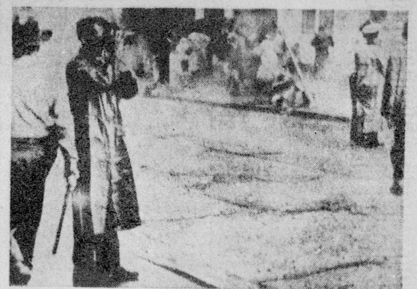
BATON ROUGE, La., Dec. 15th: An estimated 2,000 students from Southern University (all members of CORE) are shown in photo fleeing from street, as police and deputy sheriffs used tear gas to break up a demonstration by them.