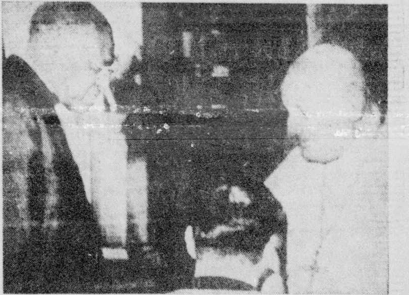
VATICAN CITY, Italy: Dr. J. H. Jackson (left), President of the National Baptist Convention, converses with Pope John, 23rd, during his audience with the Roman Catholic leader, here, Dec. 20th.