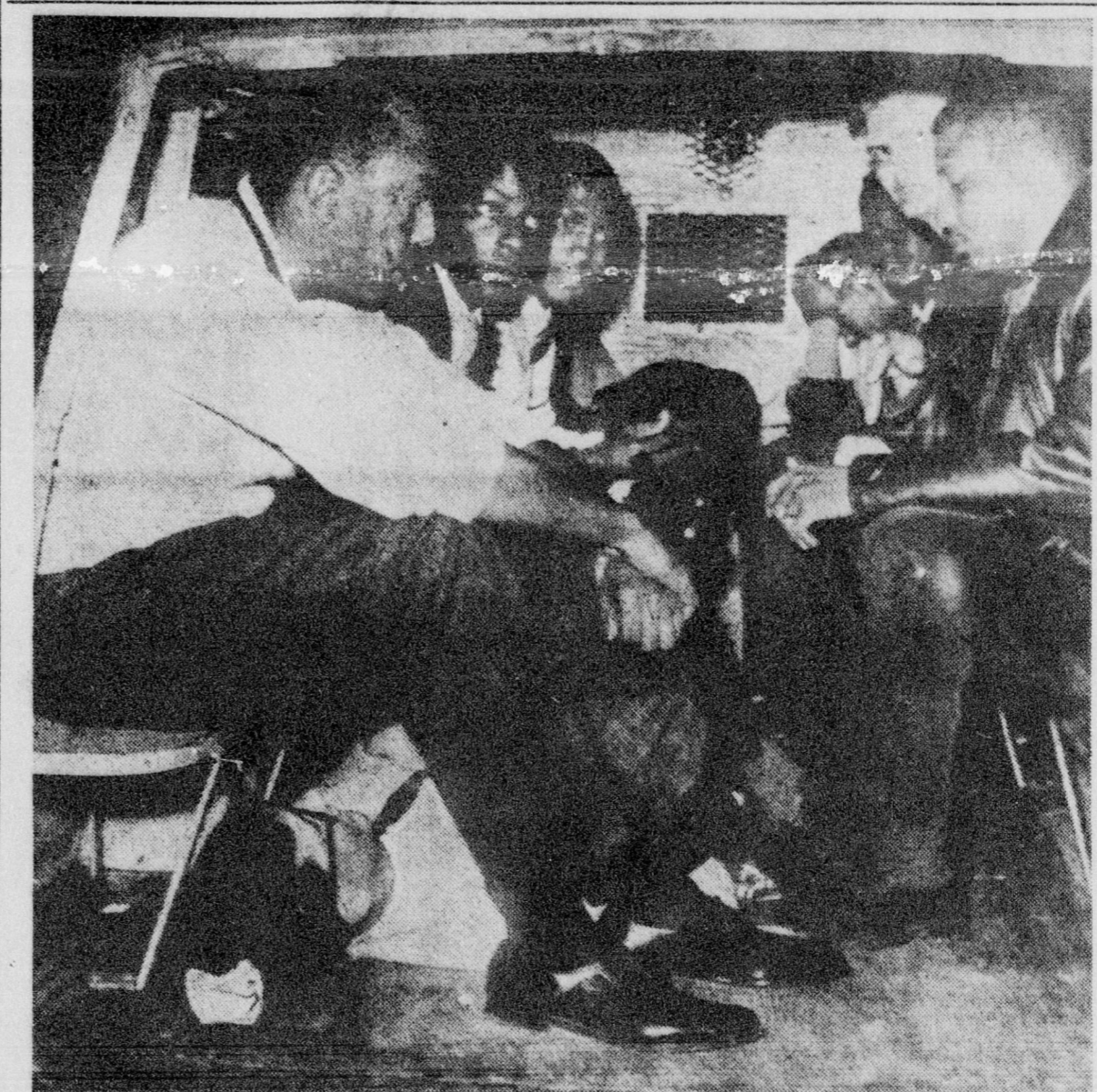
ANTI-SEGREGATIONISTS ARRESTED — A white youth, one of a group of about 250 demonstrators arrested in New Orleans for parading without a license, lies in the bottom of a patrol wagon awaiting the ride to jail. Practicing "passive resistance," he refused to walk, so he was put in bodily by officers.