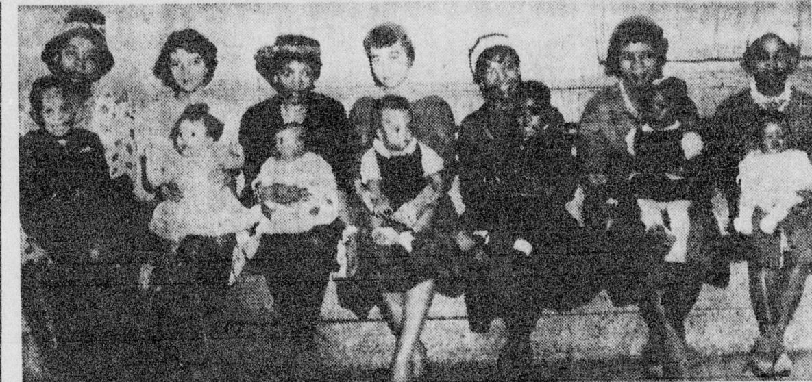
BABY CONTEST AND MOTHERS