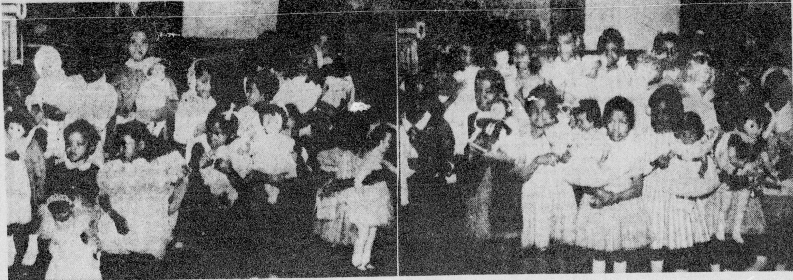
A SCENE FROM THE DOLL PARADE