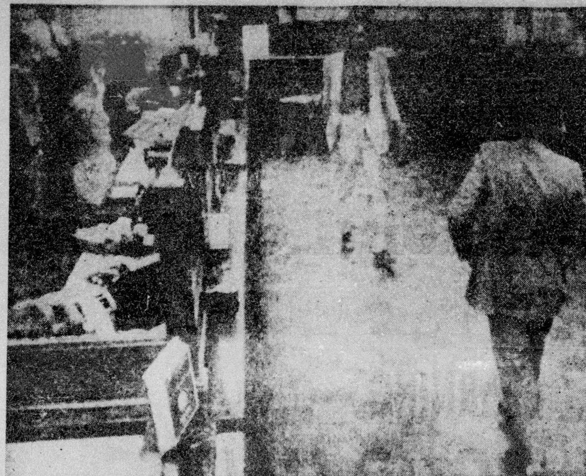
STICK UP — While two men armed with pistols held up the St. Clair Savings and Loan Co. in Cleveland, Ohio, a hidden movie camera recorded the bank robbery. Over $13,000 was taken. Note robber in background with pistol.