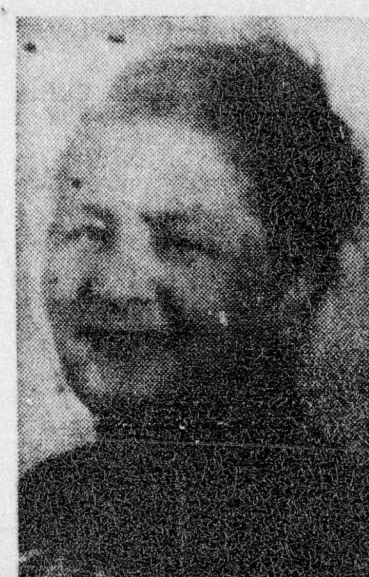
blue, would or Kelock