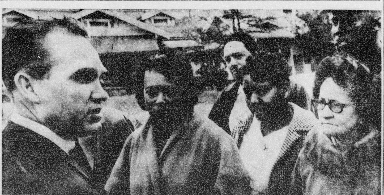
GOV. WALLACE TALKS WITH BIRMINGHAM RESthe left talking to residents of the Negro area of Birmingham ham to confer with local officials about the bombings. He also power" to bring about the arrests of those involved. Rewards toarrest.

gration would have to come after the merger.