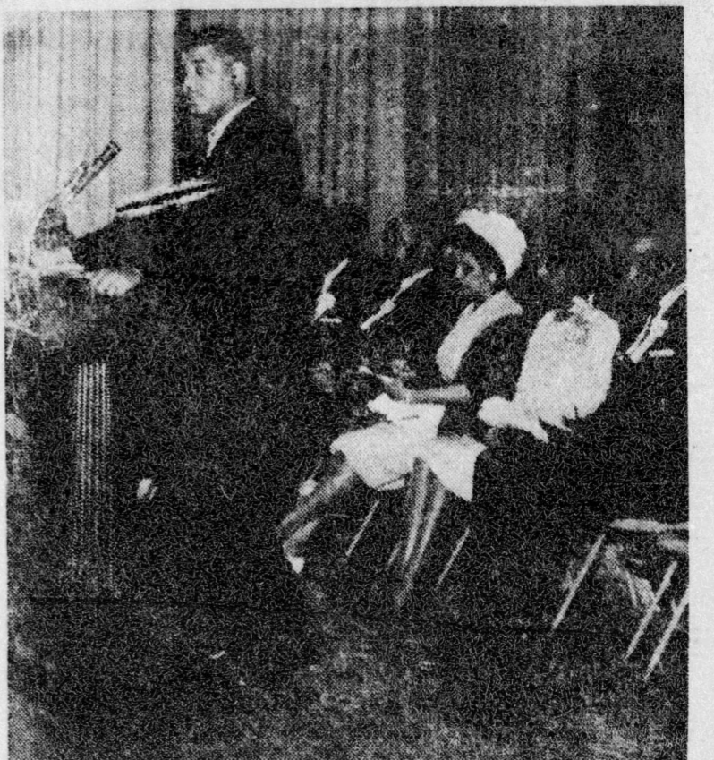
"INVISIBLE BARRIERS MUST BE REMOVED" — Standing is Dr. Whitney M. Young, Jr., executive director, National Urban League, who addressed over 1,000 delegates and other members of the North Carolina Teachers Association on Thursday night, April 8, in Raleigh Memorial Auditorium.