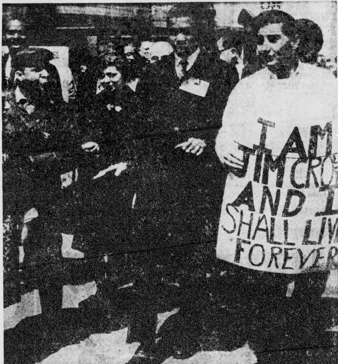
CORE PICKETS COUNTER-PICKETED—WORLD'S FAIR, N. Y.: Congress of Racial Equality (CORE) pickets (left) are met by a group of counter-pickets (right) calling itself the Society for the Prevention of Negroes Getting Everything" (SPONGE) at the World's Fair New York City exhibit last week. CORE had asked police to remove the anti-CORE demonstrators to another location to avoid any possible violence, but were refused. One CORE demonstrator was later punched in an apparent unrelated incident and no arrests were made. Both groups left within a short time.