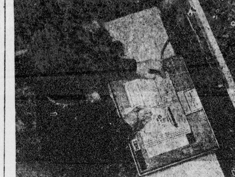
DAYTON, N. J. — A briefcase-size voting device, that weighs approximately six pounds and is expected to reduce waiting time at polling places, is now being marketed by International Business Machines Corporation.

Called the IBM Votomatic, the device uses punched card ballots, and is priced at $185 per unit. The Votomatic's low cost means that enough units can be placed in each polling place to cut down the waiting time of voters. Of more than 4,000 voters surveyed by county and state officials in Oregon and California after having used units of this type in last November's elections, 96 percent said they preferred them over hand-marked ballots. The IBM Votomatic system works like this: The voter slips a specially designed punched card into the device so that the card positions itself precisely underneath a printed ballot, which can be several pages in