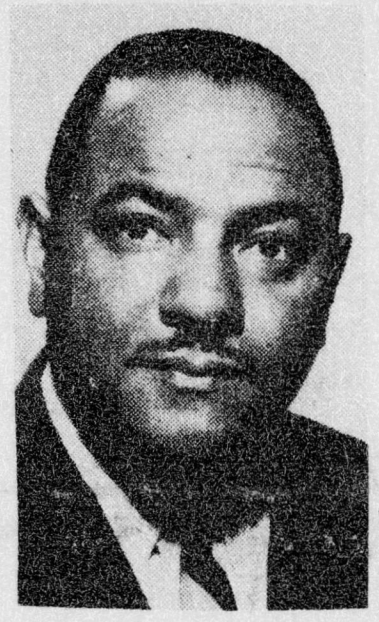
CARL T. ROWAN

SWANSBORO -- The White Oak River claimed four Negro 4-H Club members Tuesday about 5 p. m., while they were swimming during an outing of the group in a spit located eight miles west of here.